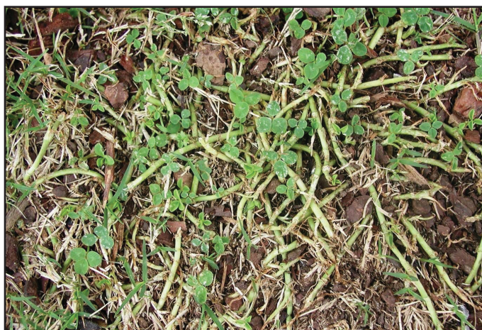
Clover persistence and grazing tolerance has been linked to high plant stolon density. Durana white clover has 97 stolons/sq. ft. compared to only 52/sq.ft. for ladino clover types.